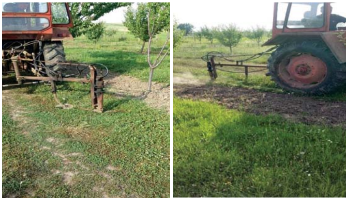
Fig. 1 Experimental equipment.

Absence in exploitation of a specialized equipment simultaneously executing both operations imposed design and implementation of a such equipment, carried on the tractor and with hydraulically actuated (fig. 1).