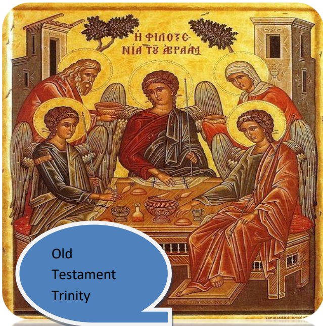
Old Testament Trinity